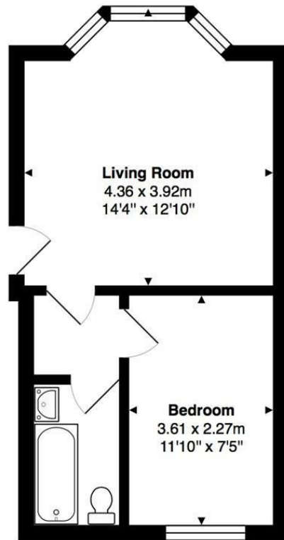
Ground Floor Area: 29.2 m 2 ... 314 ft 2